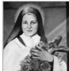
Saint Therese of Lisieux.

Catholic Daughters Court 2662 invites you to enjoy a cup of tea with delights and discover our friends in heaven. Join us in Seton Hall on Thursday, December 15, from 2:00 p.m. to 3:30 p.m. as we reflect on the life of :