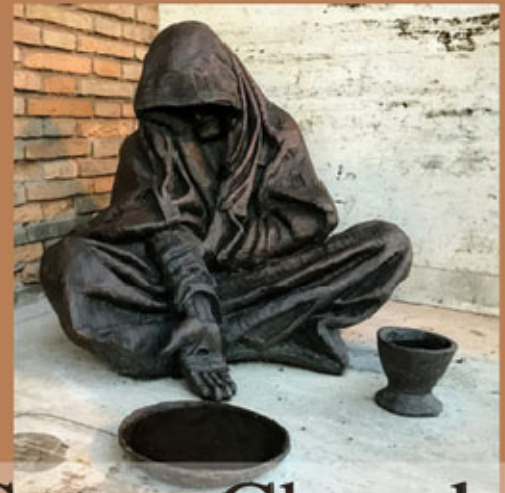
CHRIST THE BEGGAR

LORD, WHEN DID WE SEE YOU HUNGRY OR THIRSTY OR A STRANGER OR NAKED OR ILL OR IN PRISON, AND NOT MINISTER TO YOUR NEEDS?